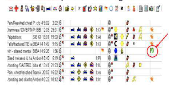
eMr - Firstnet patient Tracking board