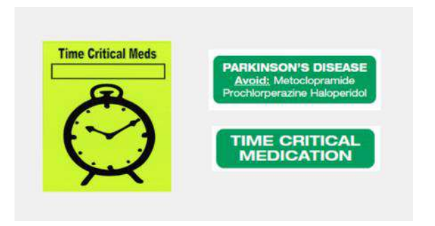
Figure 3: Medication management interventions. A: Pictorial alarm clock. B: Stickers for medication charts.

Post-implementation, all staff (100%) reported the clock had highlighted the importance of on-time medications (Table 2). In addition, 93% of patients/carers reported they were satisfied that medications were received ontime. The chart audit showed an increase in administration of PD medications on time from 44% at baseline to 63% post-implementation (Table 1).